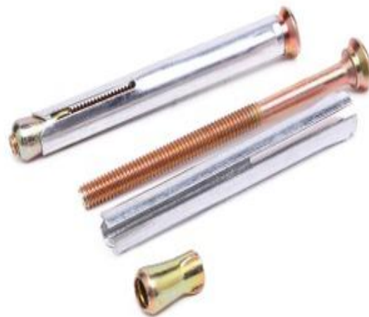
窗式壁虎\Metal Frame Anchor.