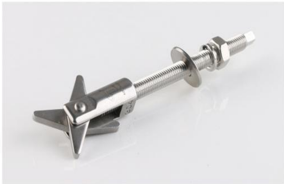
安装锚栓固定参数 (企业标准Q/321183 YJS 011-2013):