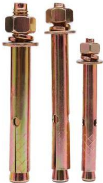
带孔膨胀\Pore Expansion Anchor.